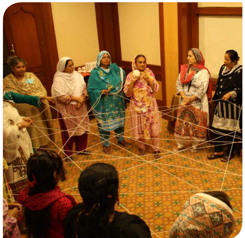
Search for Common Ground workshop