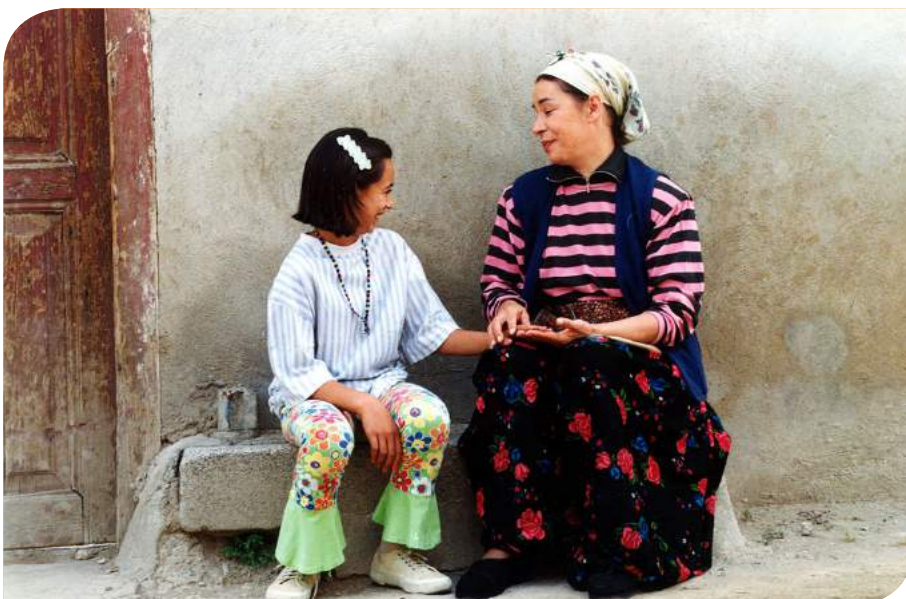
Search for Common Ground in Macedonia

The need to account to donors on how the funds are spent is necessary... but that accounting is NOT sufficient to demonstrate success.