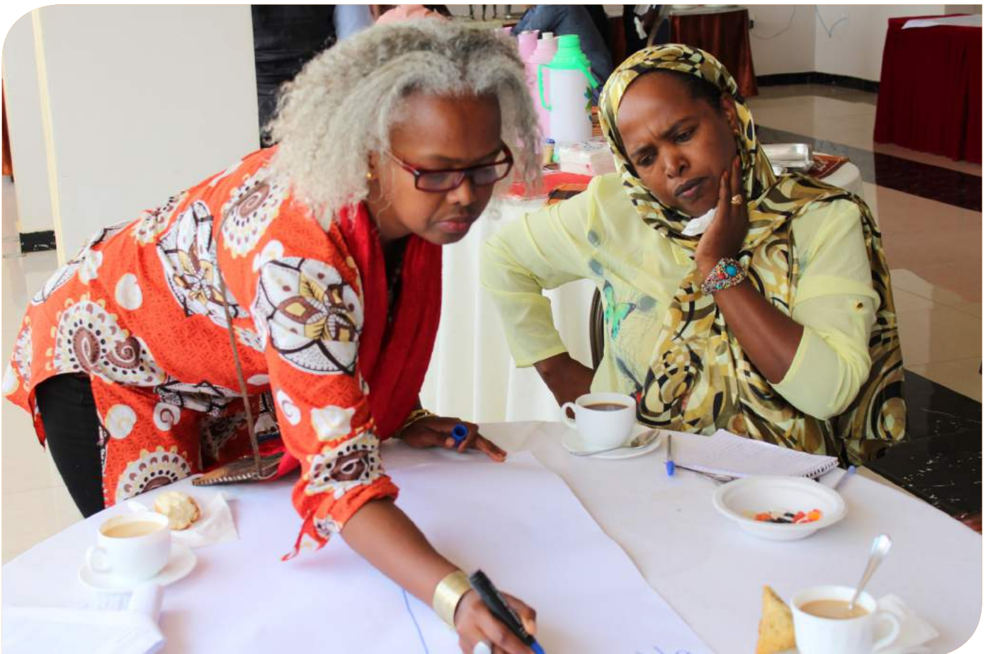
Peace Direct workshop

A shift toward bottom-up approaches is, however, apparent. It is not reliant upon good intentions, but is instead driven by concerns about aid effectiveness and accountability. For this reason, there is optimism that the balance will continue to shift toward bottom-up approaches to development, which is another step toward decolonizing development.