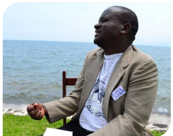
Centre Resolution Conflicts workshop, DR Congo